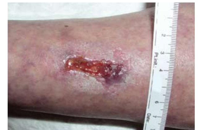
Figure 3 At the end of treatment the ulcer has reduced 68% and is composed of 85% healthy granulation tissue and 15% fibrinous tissue.