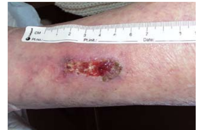
Figure 2 After ten days, the ulcer contains 70% healthy granulation tissue and 30% fibrinous tissue.