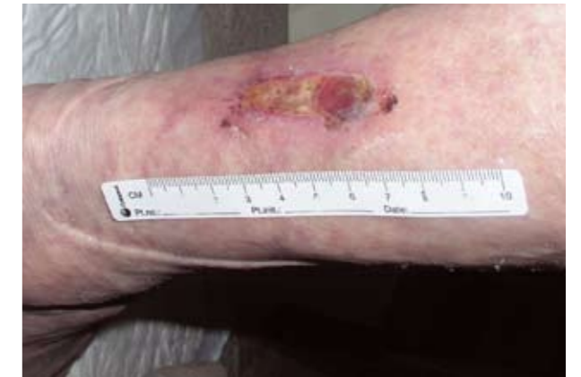
Figure 1 On day three, the ulcer is still dominated by 60% fibrinous tissue.