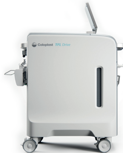
Coloplast TFL Drive