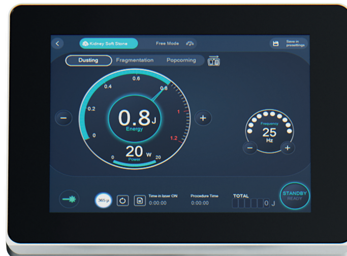
3. Review energy, power and frequency values before starting procedure