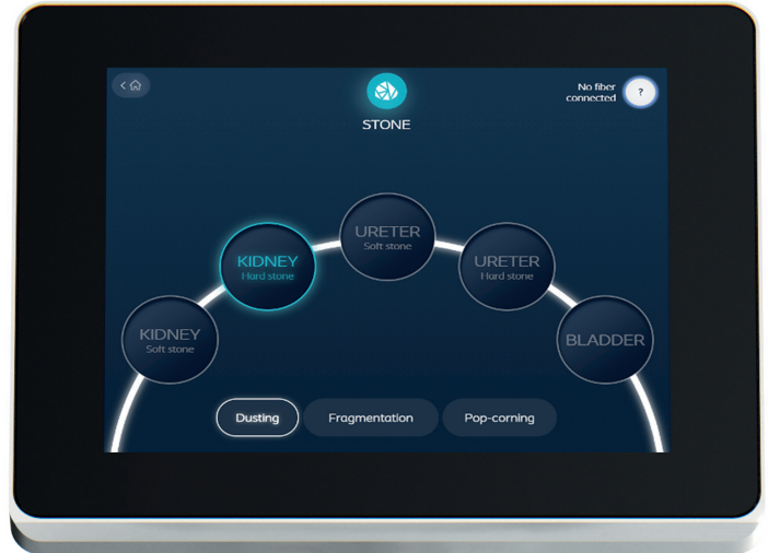
2. Choose treatment area and treatment type